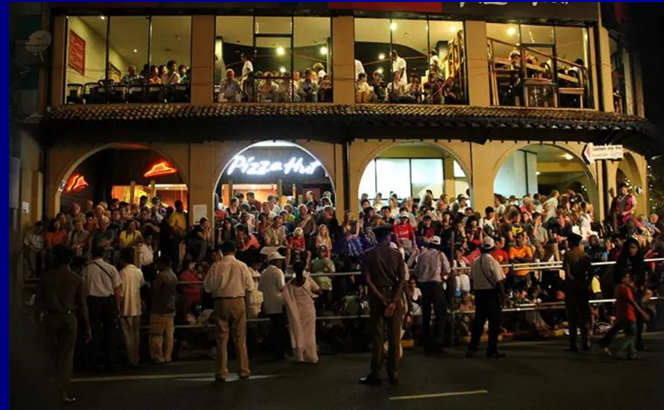
Tourists waiting to witness Esala procession, Kandy