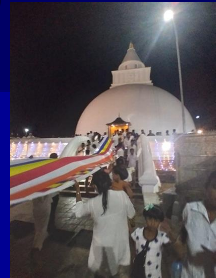
Kancuka puja at Kiri vehera, Kataragama