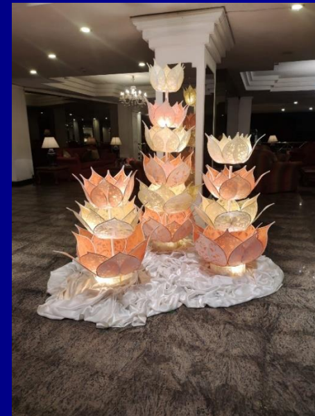
Mahaweli Reach hotel, Kandy