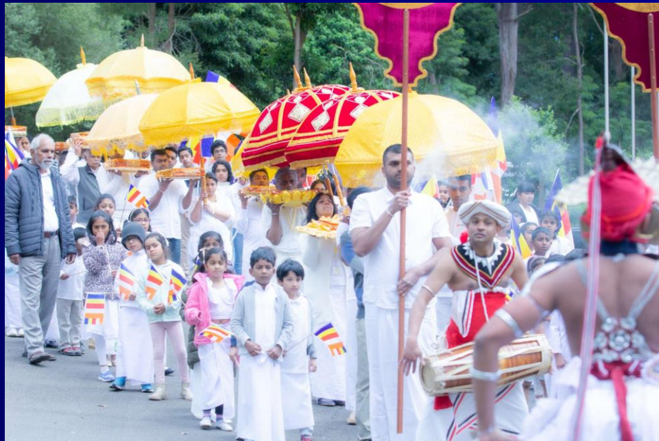
Event of Mahamevna Monastery in Melbourne