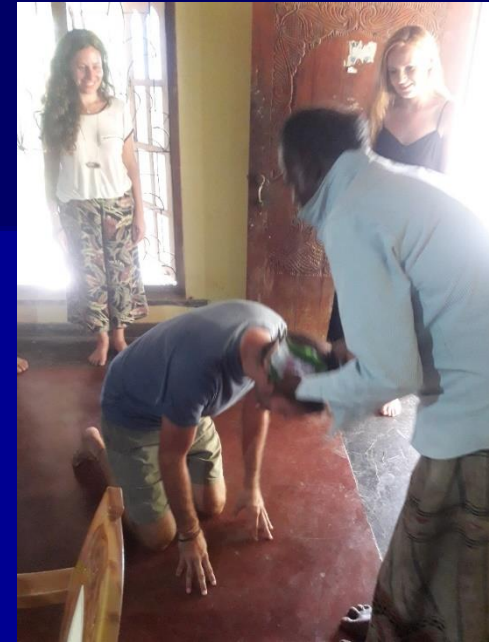
Staying like family members – Blue Mountains View, home-stay in rural SL