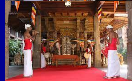
Events/rituals at the four Buddhist Cultural WH sites