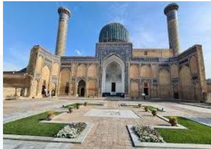
BIBI- KHANYM MOSQUE