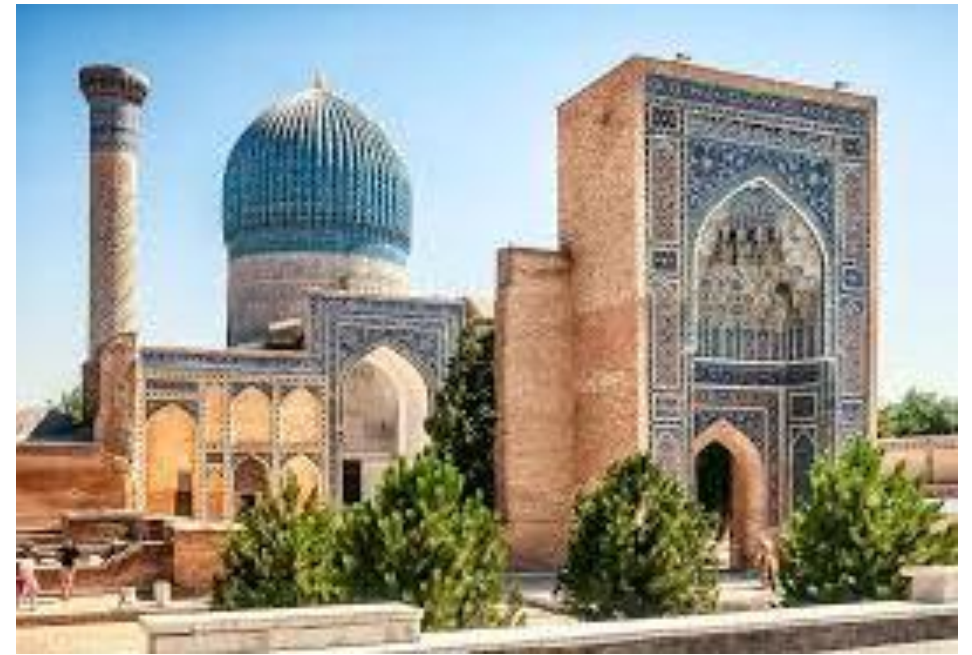
GUR- E AMIR MAUSOLEU M

•SAMARKAND IS PROBABLY THE MOST FAMOUS UZBEKISTAN'S HISTORICAL CITY. OVER 2,750 YEARS OF AGE, IT BOASTS VERY IMPRESSIVE ARCHITECTURAL MONUMENTS AND A RICH HISTORY. SAMARKAND ORIGINATED FROM AFROSIAB. THE REGISTAN SQUARE, WITH THE THREE GRAND MADRASAHSON ITS SIDES, IS THE TOP OF SAMARKAND ATTRACTIVE PLACES. THE MOST FAMOUS AMONG OTHERS ARE GUR-E AMIR MAUSOLEUM , BIBI-KHANYM MOSQUE IS ONE OF THE LARGEST MOSQUES.