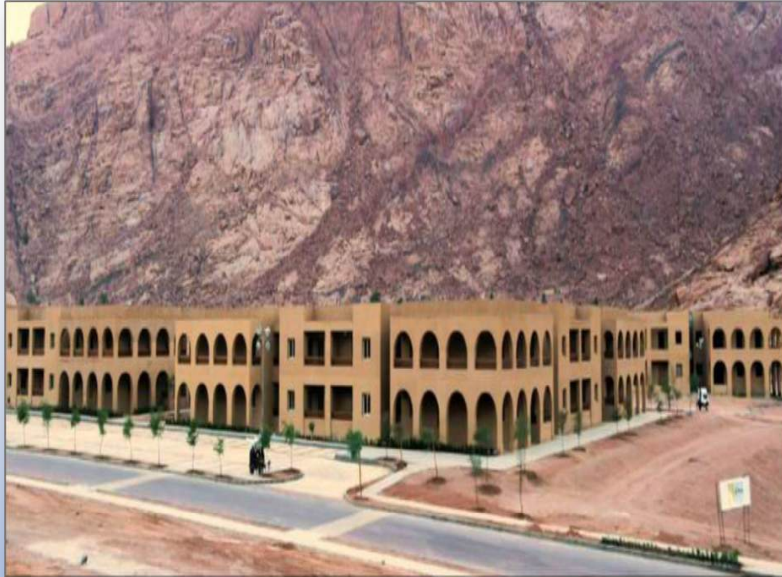
ZAITOUNA RESORT HOTEL المنتجع الفندقى بالزيتونة