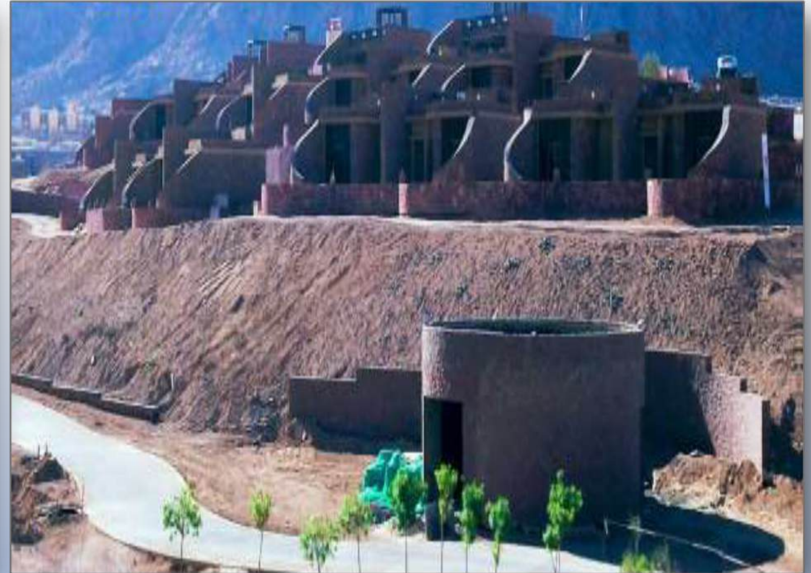
المنتجع السياحى أعلى الهضبة