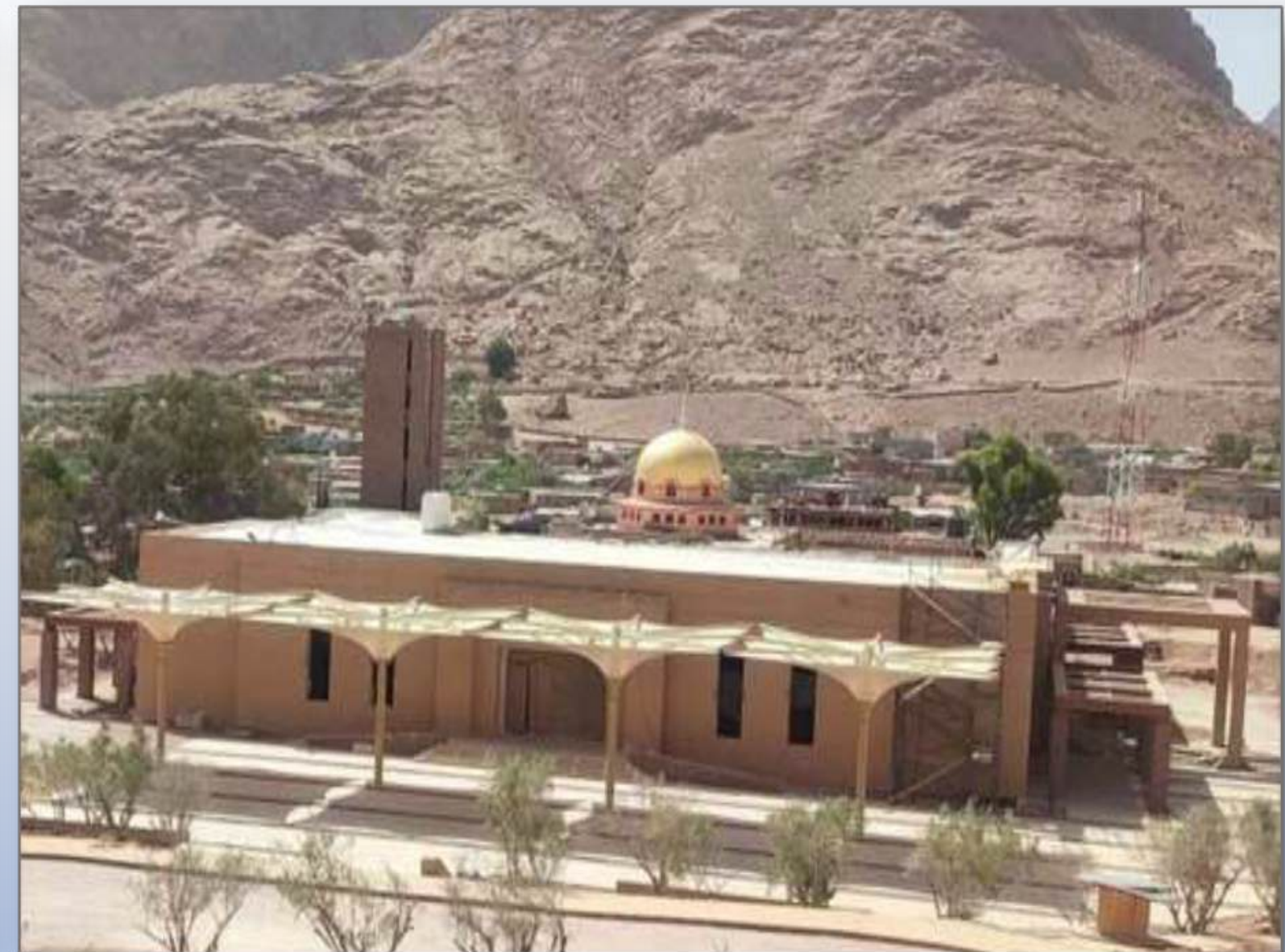
THE MOSQUE OF THE HOLY VALLEY مسجد الوادي المقدس